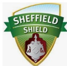
Sheffield Shield 1979/80 | cric... cricHQ.com